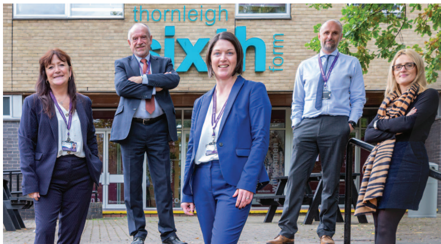
The Sixth Form Team

We believe that we can offer you the chance to achieve your full potential and we look forward to welcoming you to Thornleigh Sixth Form.